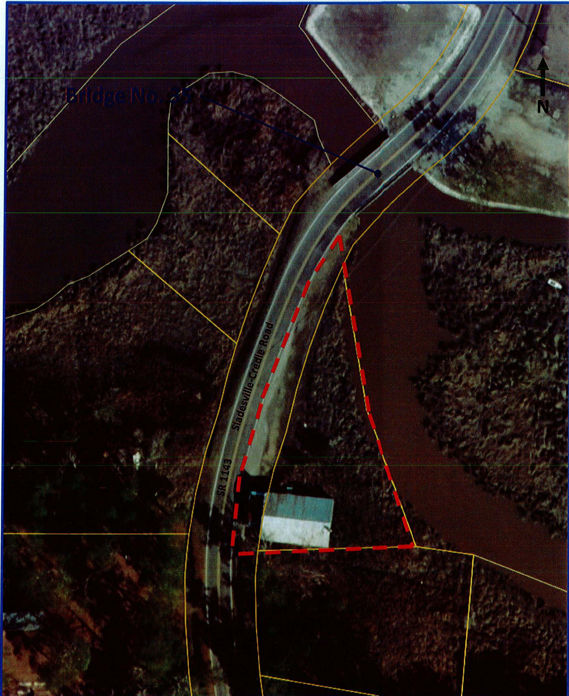
Proposed National Register Boundary Napoleon Sears Store (HY0194) #5441 Sladesville-Credle Road, PIN: 7643-72-2538 Base map: Current Hyde County GIS, nts