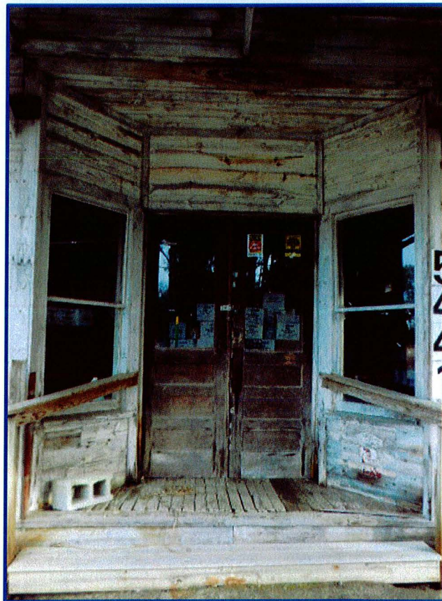
Napoleon Sears Store (HY0194). East (main) and south elevations (above) and detail of main entry (below).